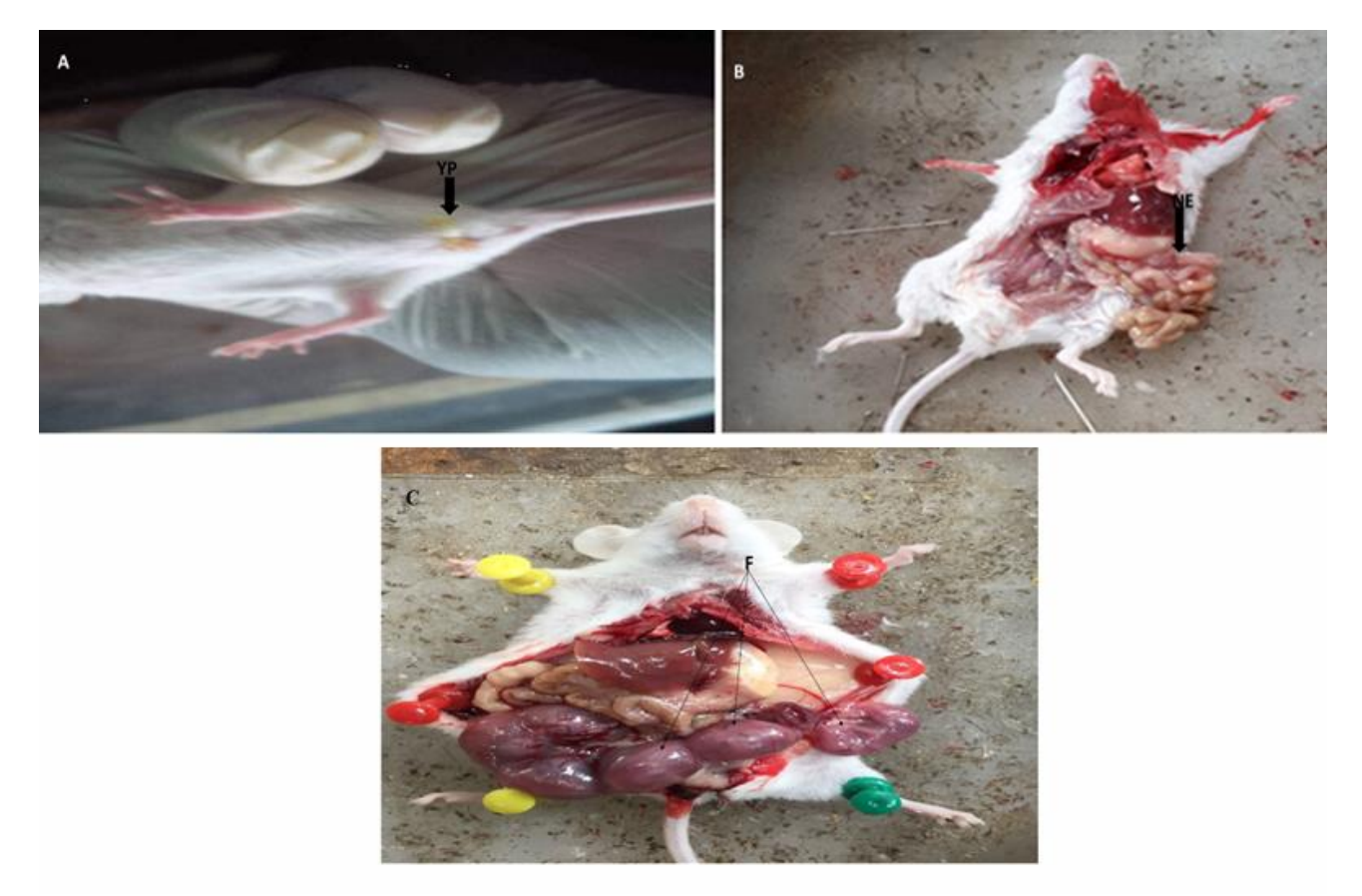
Figure 3. A – C: A-Yellow plug (YP) showing sign of mating, B-Embryo (E) absent, C- Foetuses (F) present. Treated animals did not conceive or implantation was inhibited.

No embryo or foetus was found in teratogenic studies in female mice. Phytochemical screening has also indicated the presence of some bioactive and toxic substances of plant extracts that can influence the regulation of oestrus cycle, conception and reproduction (21). Alkaloids have been indicated to decrease plasma concentrations of LH, FSH and estradiol (22). Elizzi et al. (23) exhibited that the stem